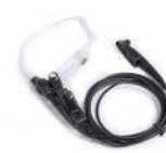
Earphone with 3.5mm Earphone connector